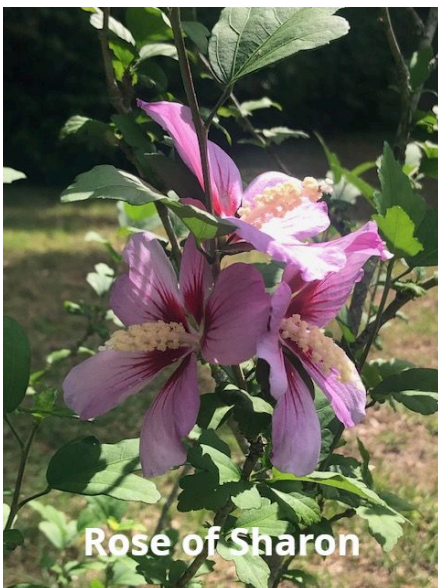
Rose of Sharon

Attention “Snapdragons” Photography Club or other interested members: