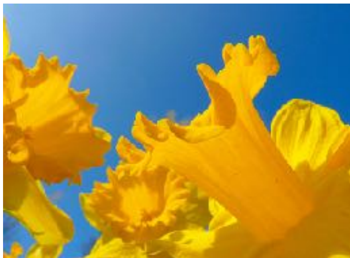
March - Daffodil