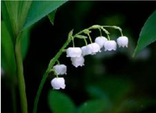
May - Lily of the Valley