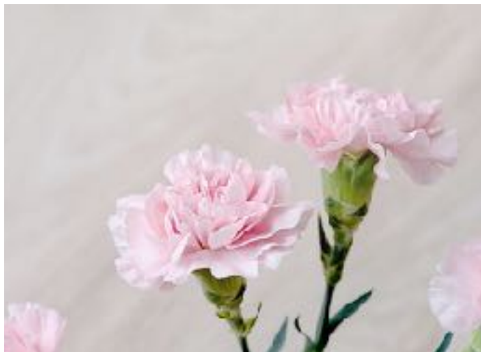
January - Carnation

If the recipient has limited space, some of these flowers can be grown in pots to put on a deck or patio or can be given as cut flowers. It is a great way to wish a Happy Birthday and get them into gardening.