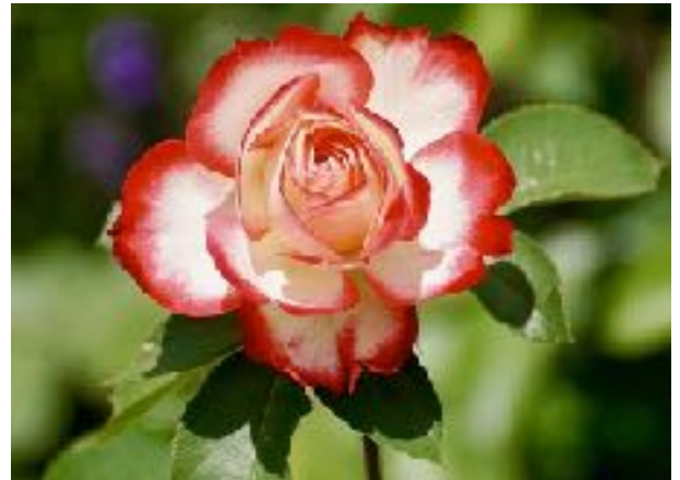
June - Rose