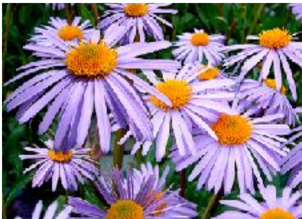
September - Aster