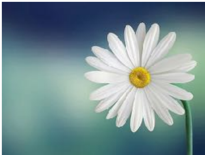
April - Daisy