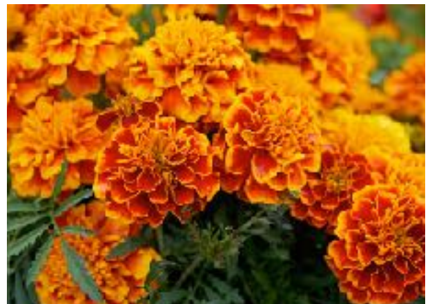
October - Marigold