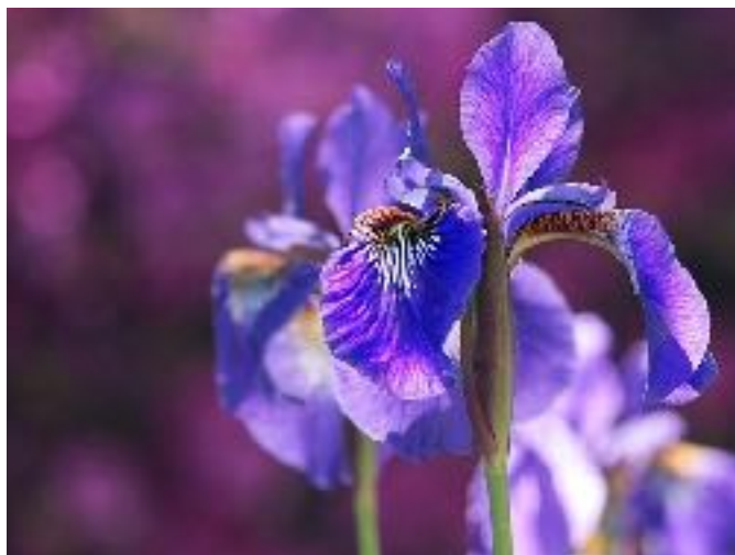
February - Iris