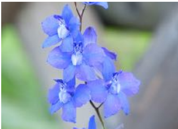
July - Larkspur