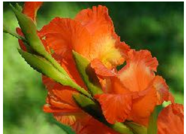
August - Gladiolus